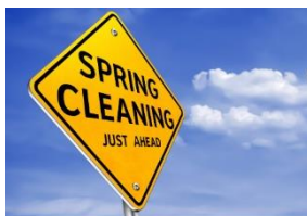
Church early summer spring clean

The foyer carpet is being cleaned on Sunday 12 July in the afternoon. It would be greatly appreciated if people could please help clear the furniture after coffee following the 10.15 service. All the coffee tables and chairs to go into the Jericho room please. Many thanks.