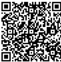
Safeguarding at Christ Church Purley

There are limited places; so, to avoid disappointment, book early. 😊