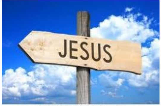
fa59237024 freeart.com ©

This short guide explains how we approach each of these milestones of faith and invites you to join us at the appropriate point in your own journey. We also want to walk that journey with you, helping you at every stage where we can with support and prayer.